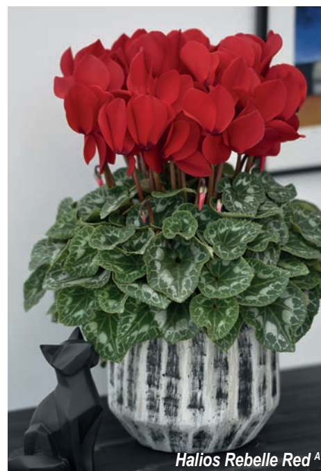
Halios Rebelle Red A