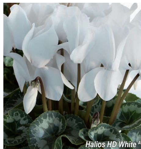
Halios HD White A