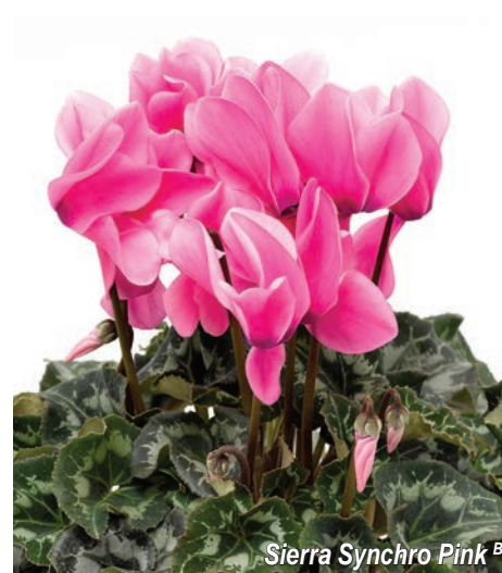
Sierra Synchro Pink B