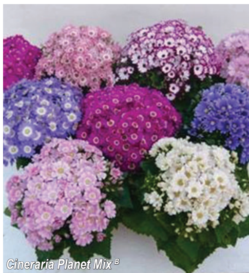
Cineraria Planet Mix B