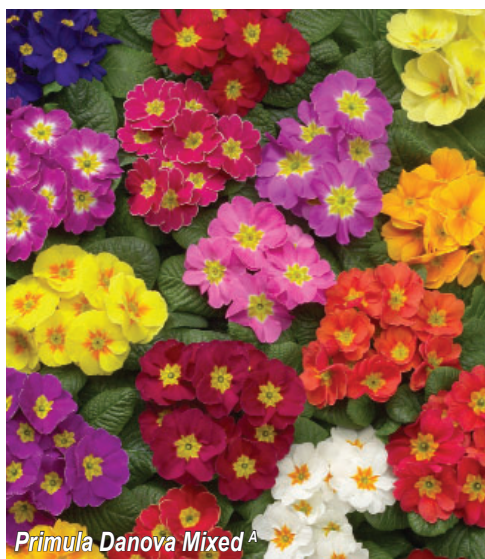
Primula Danova Mixed A