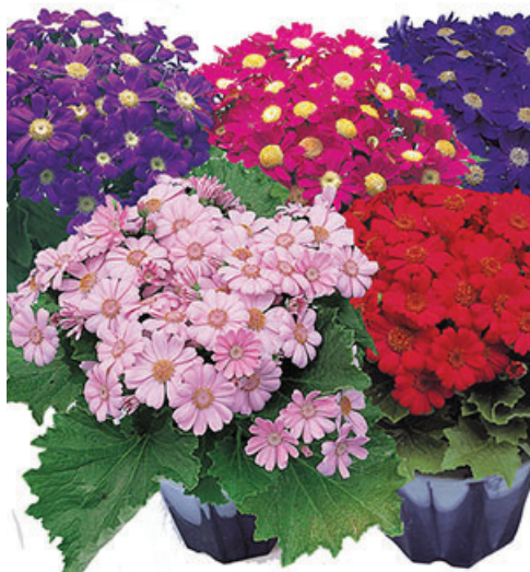
Cineraria Early Perfection Mix B