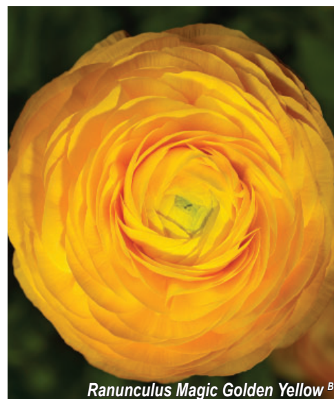
Ranunculus Magic Golden Yellow B