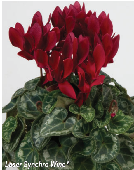
Laser Synchro Wine B