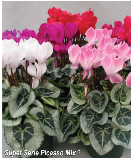
Super Serie Picasso Mix C