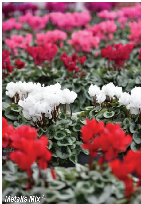
Metalis Mix A