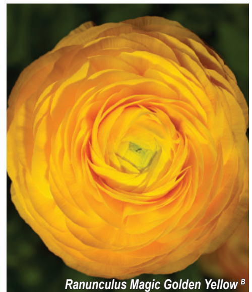
Ranunculus Magic Golden Yellow B